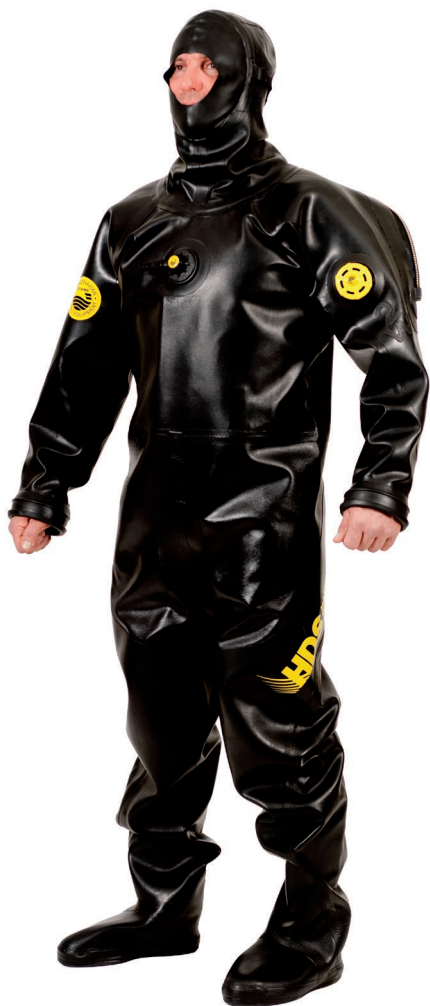
VIKING™ HDS with Magnum hood.

The VIKING™ HDS sets the standard amongst vulcanised rubber drysuits. Made from the unique NITECS material, it provides unsurpassed protection against chemical permeation along with extreme durability against wear and tear.